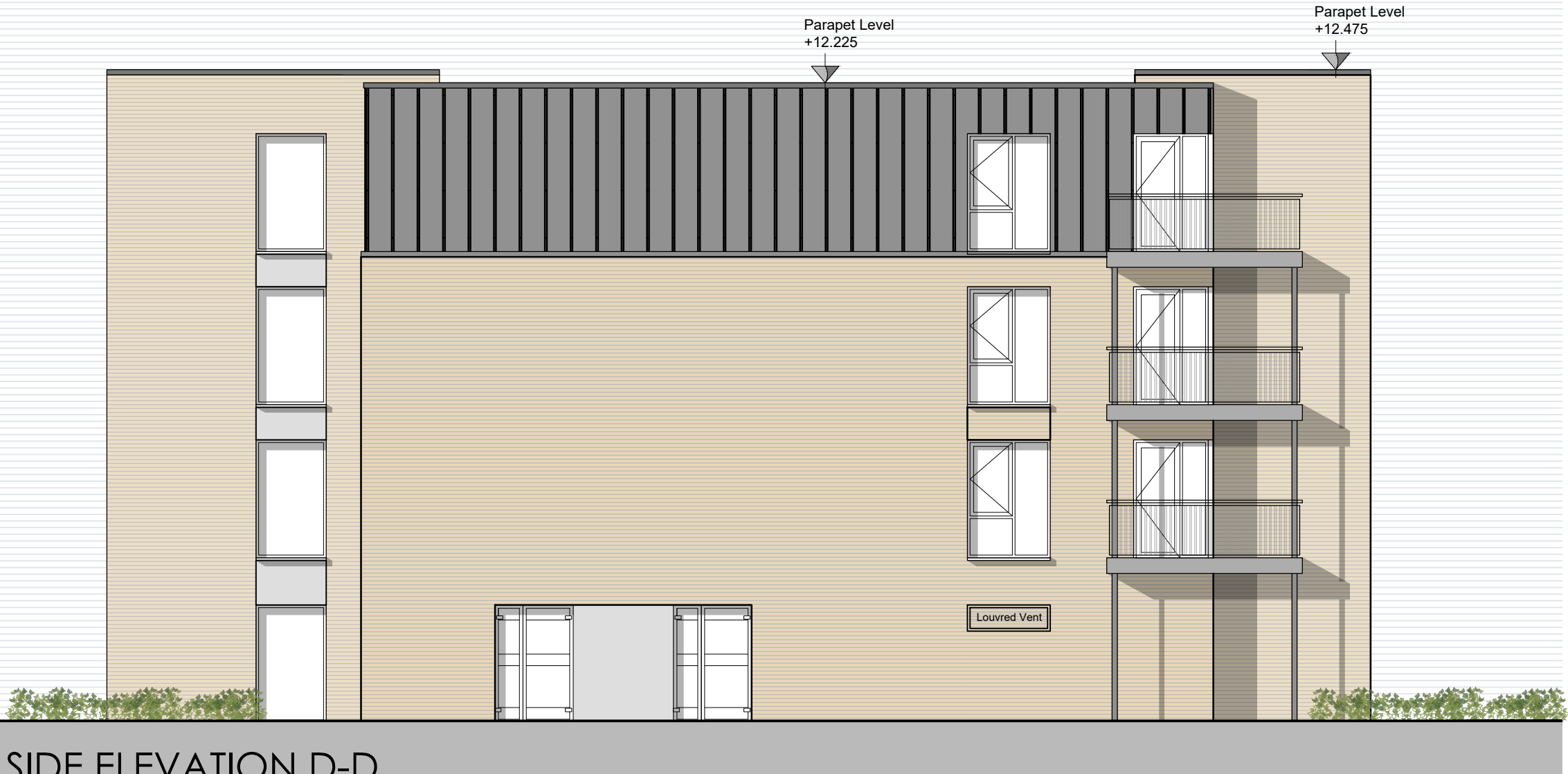
SIDE ELEVATION D-D 1:100